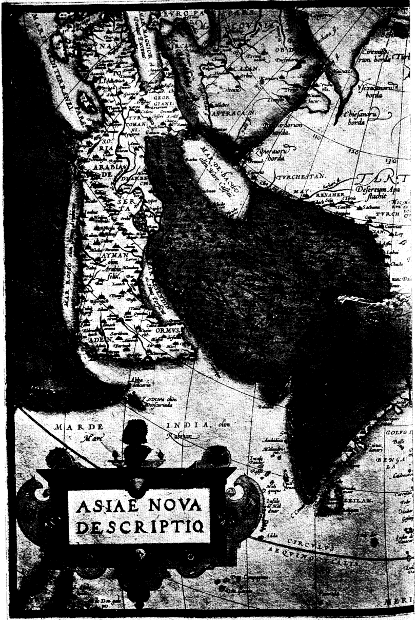
“Asiae nova descriptio”– Abraham [From original (in colors),