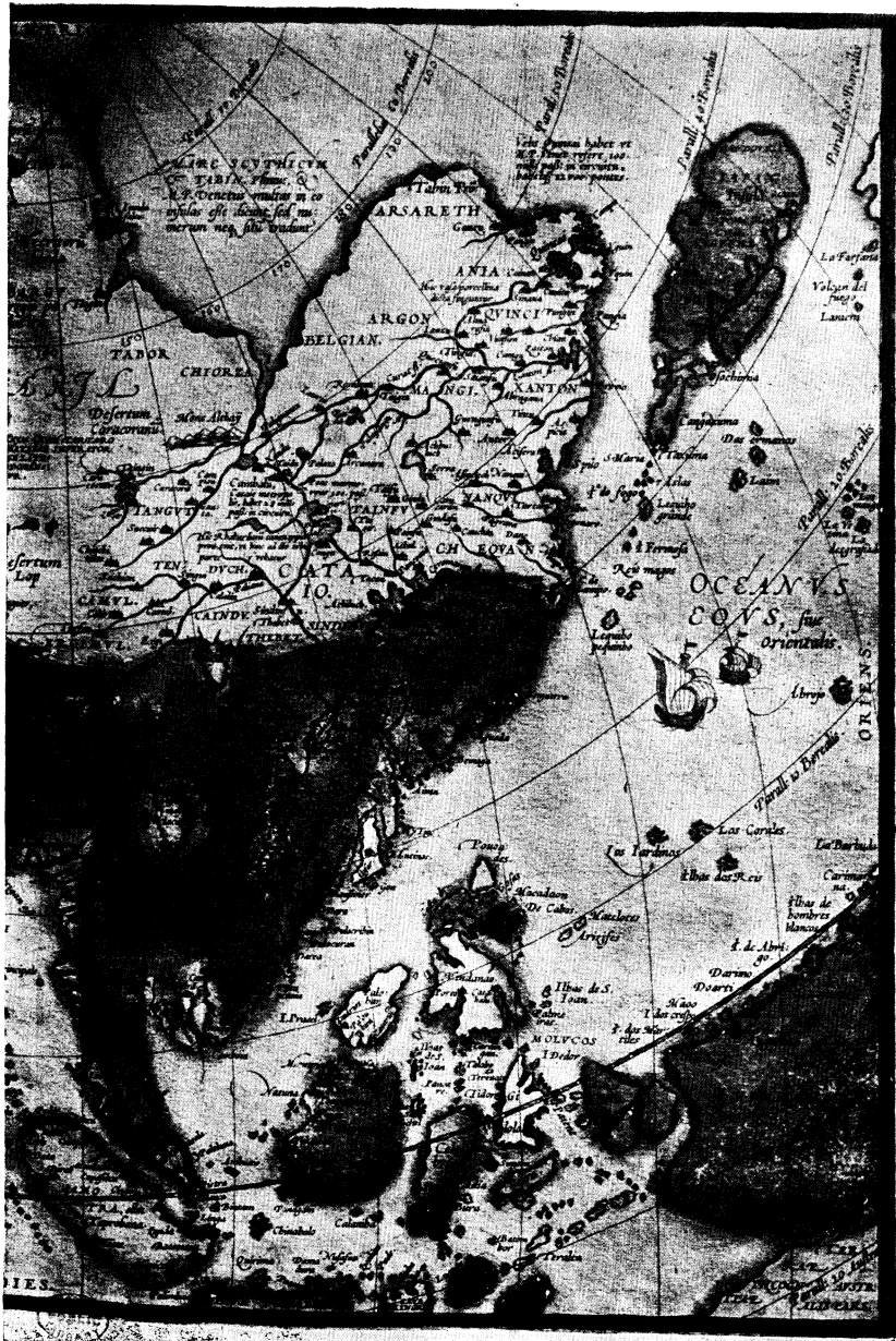
Ortelius (Antverpiæ, M. D. LXX) in Boston Public Library]