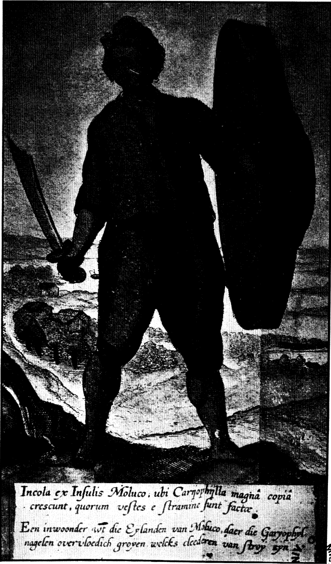
“Incola ex Insulis Moluco” (picture of a Moluccan warrior), from Voyage ofte Schipvaert , by Jan Huygen van Linschoten (Amstelredam, CIO. IO. XCVI)

[From original (in colors), in Boston Public Library]